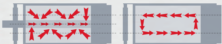
Weiler twin overlapping, counter-rotating paddle system with unload screw.