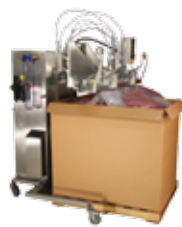
Bulk Bin Rollaround